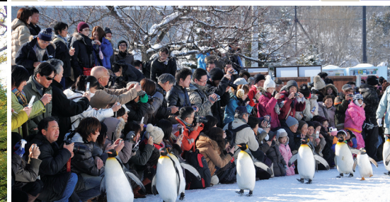
Asahiyama Zoo penguin parade

that would please the inner Hansel or Gretel in you. End your tour on a sweet note at the famous café with complimentary cupcake and tea . Thereafter, stop by Otokoyama Sake Brewery and Museum in Asahikawa to learn more about the production process of one of Japan's finest sakes. You will also get the opportunity to sample different types of sake. All that is left is to say "Kampai". Tonight, wind down and indulge in a relaxing mineral hot spring bath at an onsen resort in Sounkyo , in the company of memories of a day well spent.