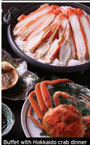
Buffet with Hokkaido crab dinner